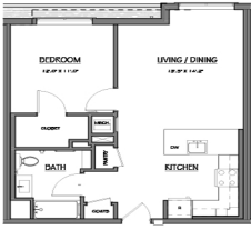
ONE BEDROOM - 720 SF