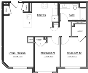
2 BEDROOM - 940 SF